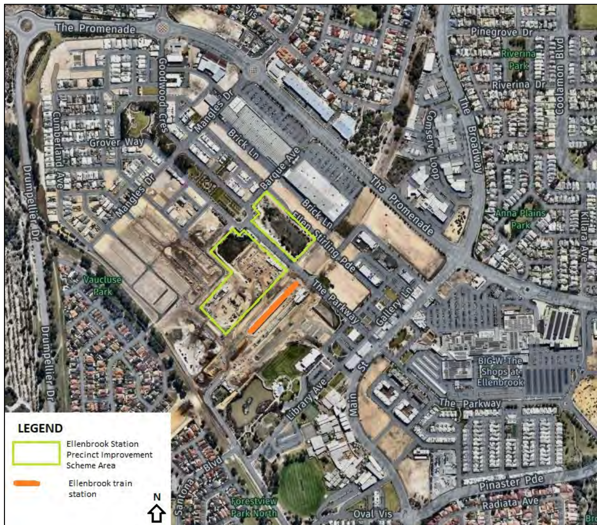
Figure 1: Ellenbrook Station Precinct location plan